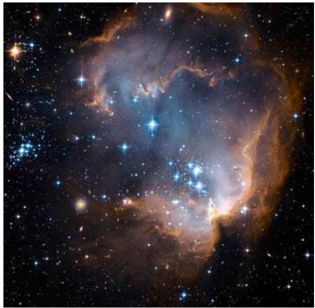
NASA's Hubble Space Telescope image of newly formed stars.

"Without, a city's whirling dust, a city's alley-wall: